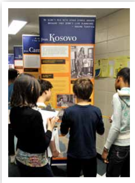
Students viewed Changing Worlds' Traveling Exhibits

Highlights of Changing Worlds' programming at Lincoln included its traveling exhibit, classroom workshops, and an interactive storytelling performance. Fourth and fifth grade students, after viewing photos of the children in the exhibit, imagined themselves as one of the children through an "I am..." series of writing exercises. This enhanced their desire to learn the real stories of the children in the exhibit and reconsider their first impressions. In second and third grade classrooms, Changing Worlds facilitated a map, timeline and art activity called "Defining You" that built on previous work the students had done to learn about their family roots. Additionally, all classes at Lincoln enjoyed storyteller Mama Edie Armstrong's interactive performance, honoring cultures from many lands.