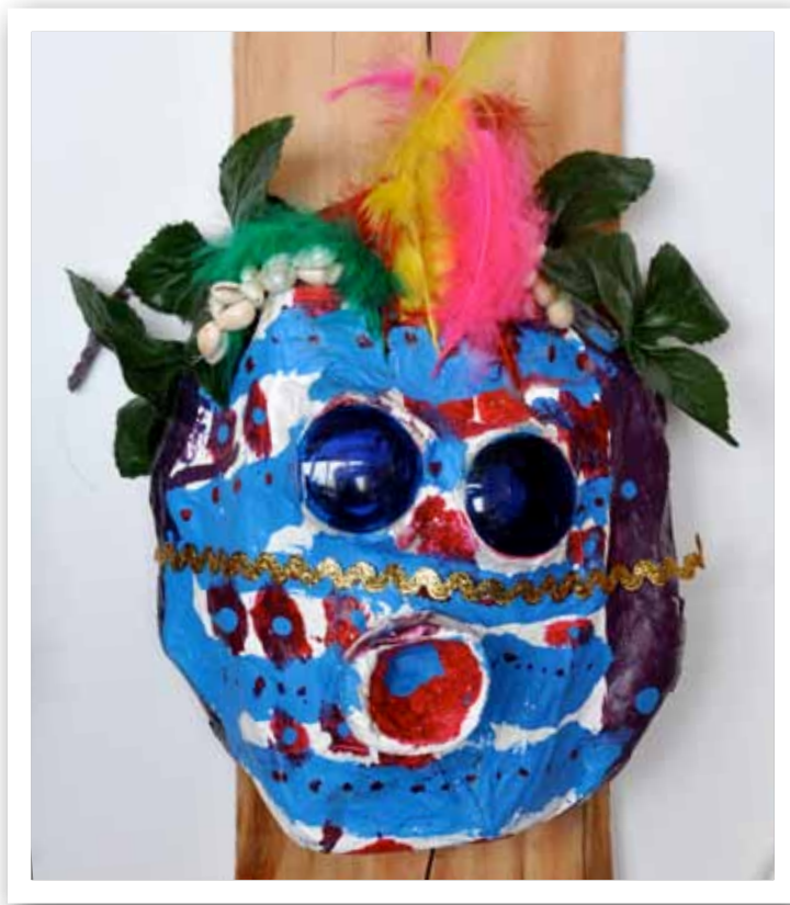
Student artwork created as part of after-school programming