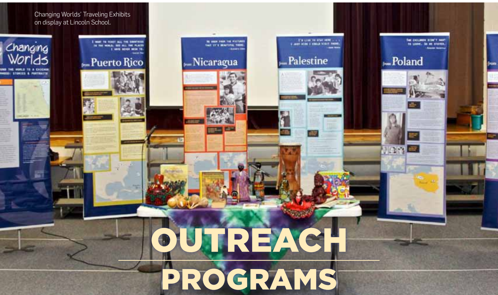
Changing Worlds' Traveling Exhibits on display at Lincoln School.

Changing Worlds conducted many other outreach programs this year. The public enjoyed a student art exhibit at the 55 E. Monroe building downtown. It reached university students through an exhibit and workshop at Northeastern Illinois University and North Park University. Through World Chicago, it conducted a workshop with Serbian youth visiting the United States on a leadership development program. With high school students from the Harris Fellows Student Leadership Conference, it also conducted a dance workshop exploring race and culture. For the first time, the exhibit was sent out-of-state to the National Refugee Healthcare Conference in Rochester, New York.