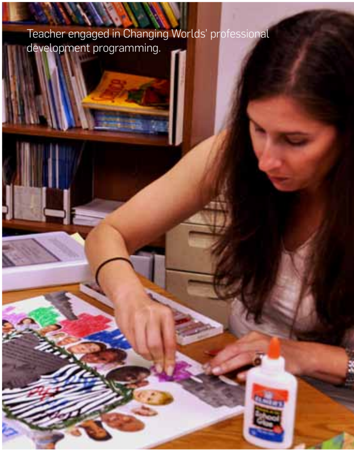
Teacher engaged in Changing Worlds' professional development programming.

Changing Worlds provides resources to teachers, teaching artists and literacy specialists to assist them in integrating arts, culture and family history into curriculum that encourages student-centered classroom communities. In addition to modeling techniques in its classroom residencies, Changing Worlds conducts professional development workshops and a week-long Summer Institute. This year, over 100 educators and artists from across Chicago participated in the organization's trainings. While its programs continue to expand, so does the need. One of the participants noted, "I wish more people could attend. Many teachers need to be aware of culturally responsive teaching in their classrooms."